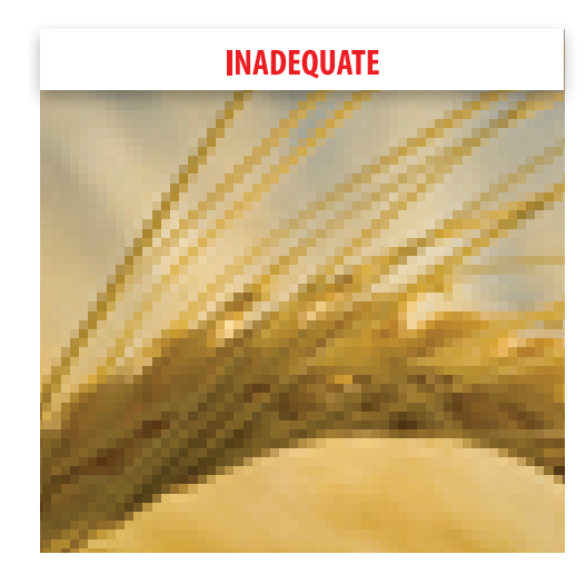
This image is only 72dpi (typical of web graphics). When enlarged, each pixel becomes more apparent; thus resulting in an undesirable "pixelated" image.